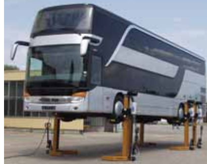
Truck, bus and rail applications

If you require truck, bus or rail hoists that give you ease of operation, the highest level safety and offers full height travel of 1.75 metres to give a comfortable safe work area please call Airdraulics on 07 3275 3333 or email info@airdraulics.com.au