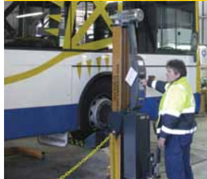
On-post controls (all columns)