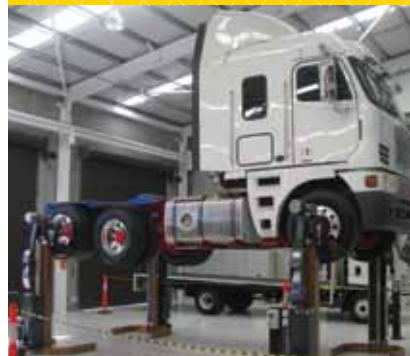
No cables or linking required for RGA