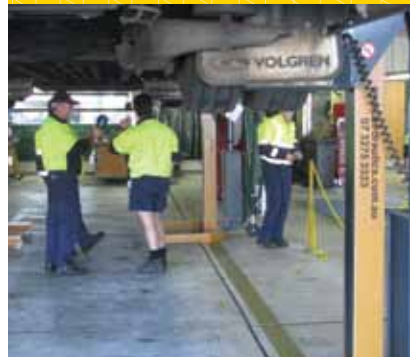
Great lifting height on all models